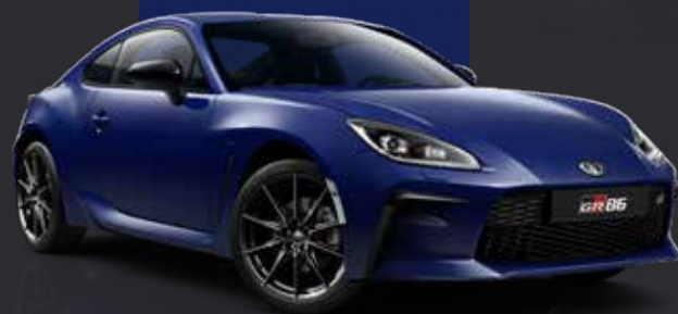
Sapphire Blue (WCH)