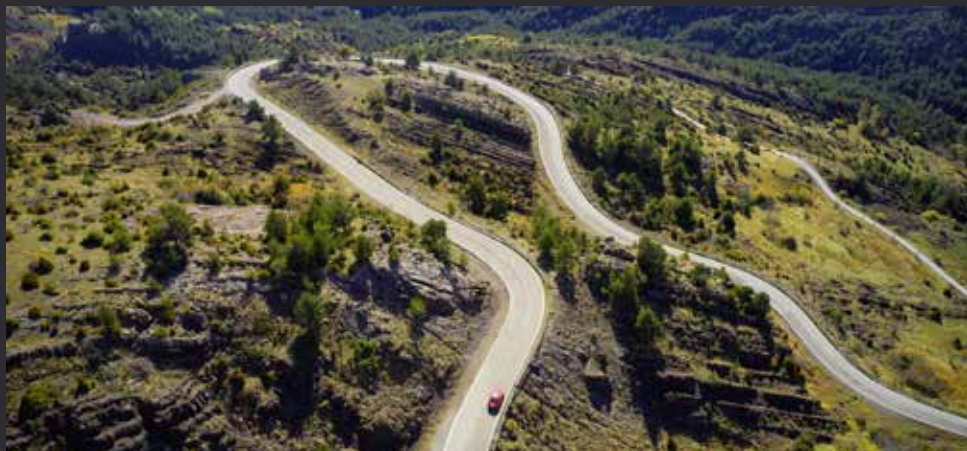
GR86's low centre of gravity makes handling corners effortless.

Enjoy the raw driving thrill of the revolutionary new horizontally opposed four-cylinder engine. Our lightest four-seater coupe ever, the result is a truly exhilarating driving experience.