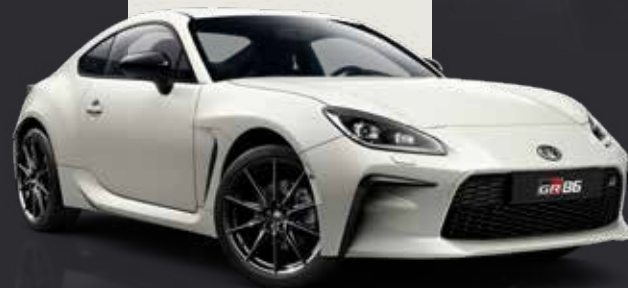
Crystal White (K1X)