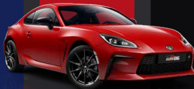
Ignition Red (DCK)*