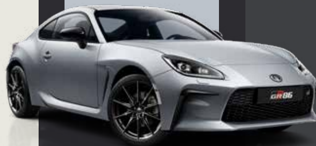
Ice Silver (G1U)*